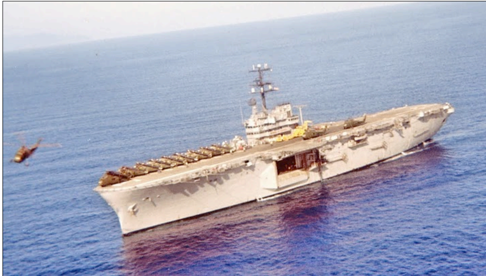
USS Okinawa LPH 3