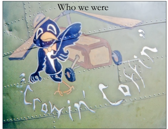
Who we were