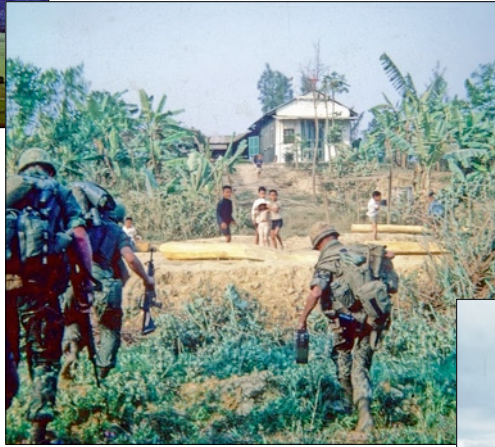
men we served