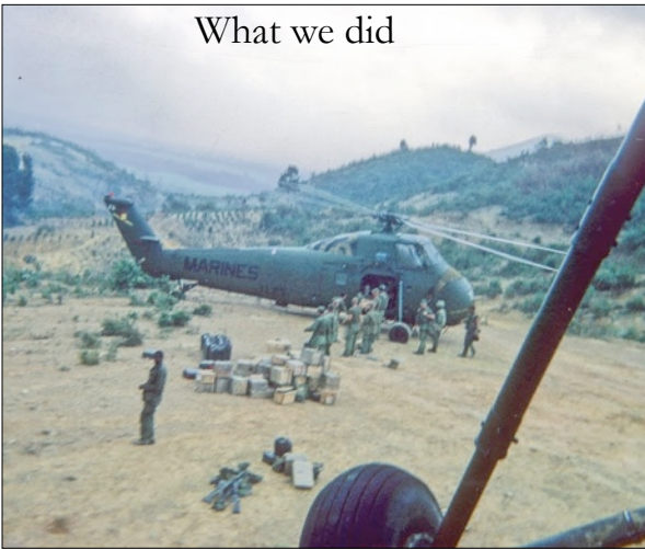
What we did