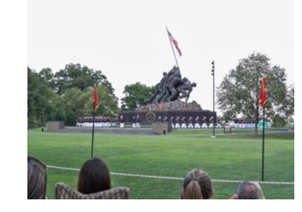
USMC War Memorial