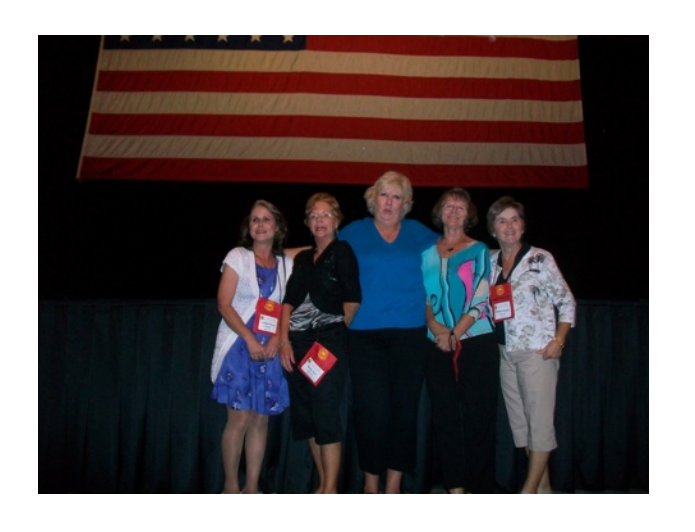
The Girls, Beauties All