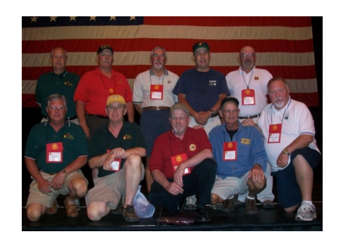
The Guys Who Did the Work