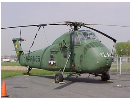
Restored YL 42 at the National Museum of Naval Aviation at NAS Pensacola, August 1998

Ever wonder where your contributions to the Ugly Angel Memorial Foundation go? Below are two of the projects the UAMF has initiated and completed. There are also this newsletter, the website, and several smaller projects.