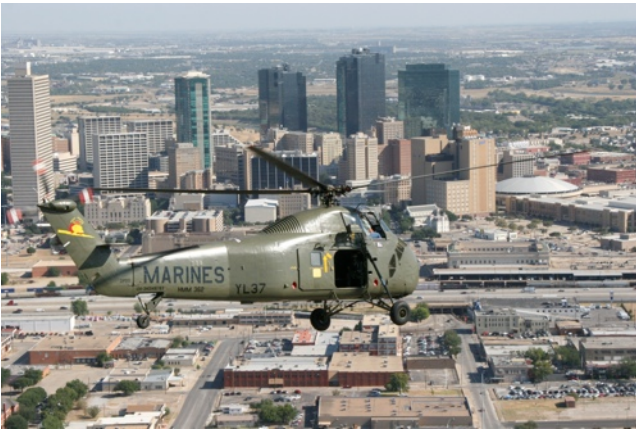
YL 37 at Dallas Reunion 2004