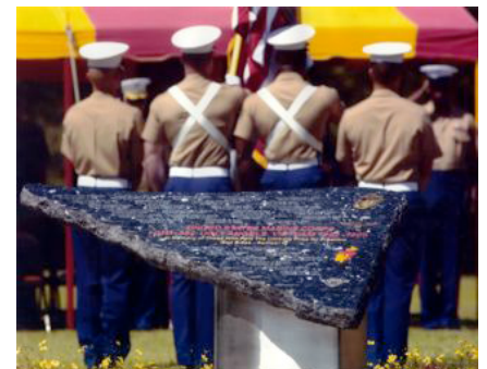
Ugly Angel Memorial dedicated at MCB Quantico, July 2000

Overhead in the Ops office: "Teamwork is essential - It gives them other people to shoot at"